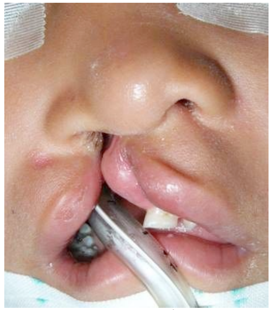
Figure 1 INITIAL DEFORMITY

Pre-operative picture just before surgery.