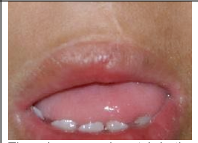
There is some mismatch in the red line.