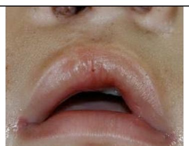
There is not a noticeable mismatch in the red line.