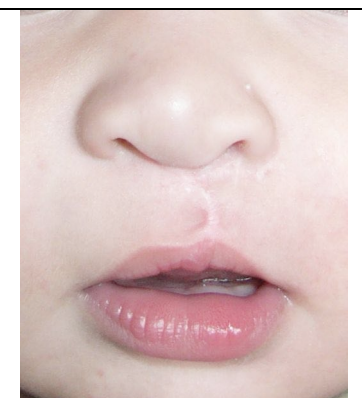
There is a small notch and a small bulginess in the free vermilion.