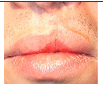
Severe discrepancy in the wet/ dry vermilion relationship.

The red line should be a continuous with a normal wet and dry vermilion relationship.