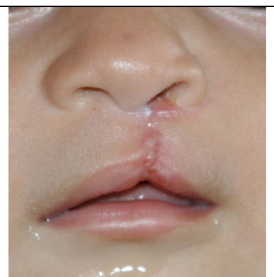
There is a clear notch and asymmetry.

The free border of the lip has to be a continuous smooth curved line with no notch or bulginess.