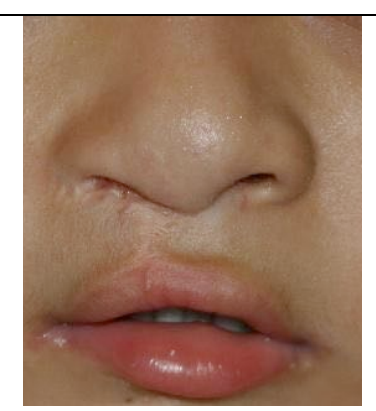
There is a continuous smooth curved line.